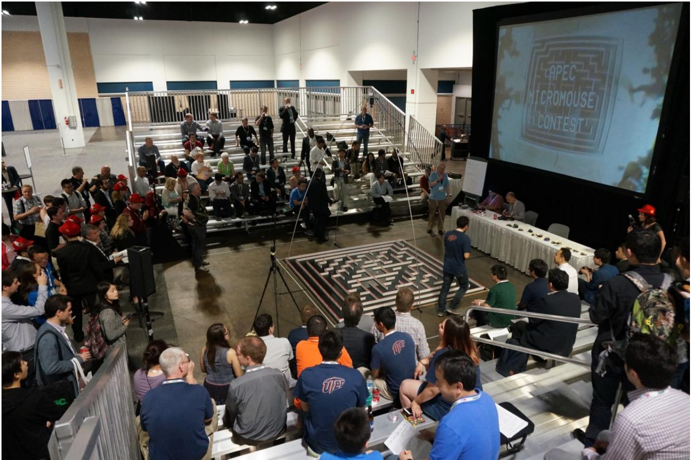
APEC 2017 MicroMouse Contest Venue

The table below contains a list of the scores for each mouse that was able to solve the maze. The score is based on 1/30 of the time used to search the maze prior to the start of each run ( maze time ), and the time of that run ( run time ). If the mouse had been manually restarted prior to the start of a run ( touched ), a penalty of 2 seconds was added to the score.